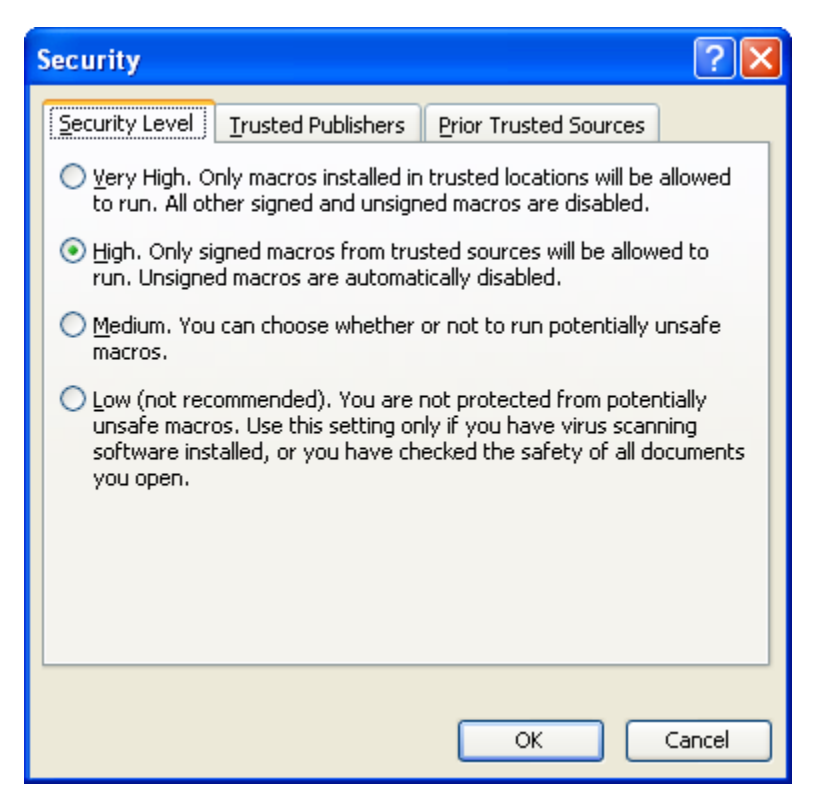
Figure 2: Security dialog box in Office 2003 (Tools->Macro->Security)

Microsoft Word, Excel, and PowerPoint in Office 2000 and higher allow the user to set one of three security levels – high (the default), medium, or low (see figure 3-1).